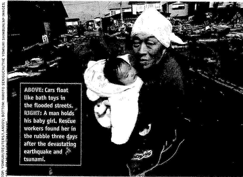
ABOVE: Cars float like bath toys in the flooded streets. RIGHT: A man holds his baby girl. Rescue workers found her in the rubble three days after the devastating earthquake and tsunami.